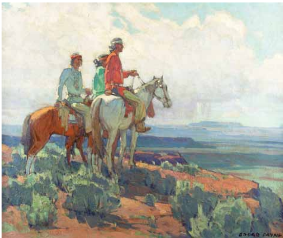
Edgar Payne (1883-1947), Navajo Scouting Party , oil, 28 x 34. Estimate: $400,000-$600,000.

JACKSON, WY, is well known and oft visited for its abundant wildlife and incomparable Rocky Mountain scenery, so the fact that it's home to a world-class auction known for sporting and wildlife art comes as little surprise. This month Trailside Galleries of Jackson and Gerald Peters Gallery of Santa Fe partner to present the 11th annual Jackson Hole Art Auction, with over 350 lots of both contemporary and historic fine art up for bid in two sessions, beginning at noon on both Friday and Saturday, September 15-16.