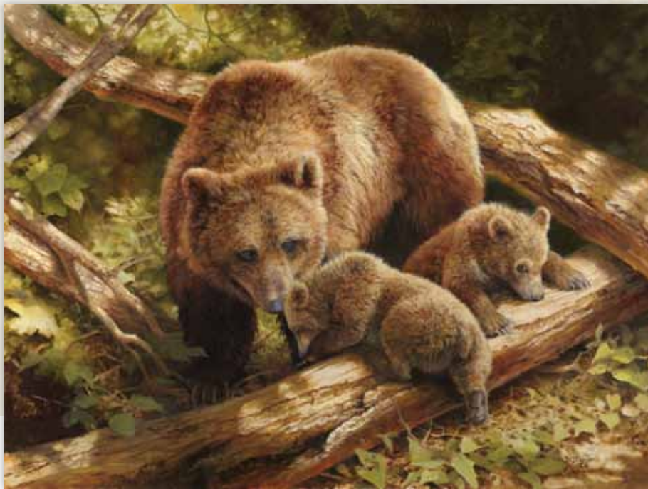
Bonnie Marris, Born to be Wild, oil, 36 x 48. Estimate: $25,000-$35,000.

will find incredible offerings,” Mowery notes. A collection of 25 oil paintings, charcoal drawings, and lithographs, which spans the breadth of the Taos Society of Artists member’s career, includes the 1917 painting TAOS PUEBLO, a 10-by-14-inch oil estimated to sell for $30,000 to $50,000, and SAN FRANCISCO DE ASIS MISSION CHURCH, TAOS, a 10-by-12-inch oil ($20,000-$30,000). Also up for bid are a casting of Frederic Remington’s THE CHEYENNE ($80,000-